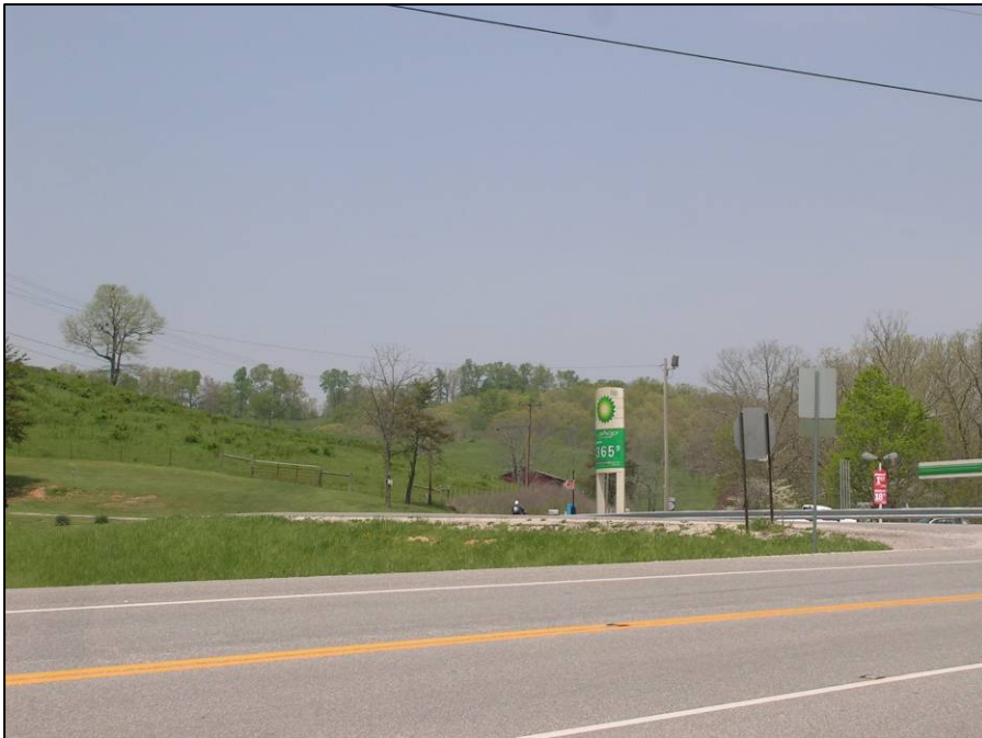
KY 32 and Route 7 (Elliott County)