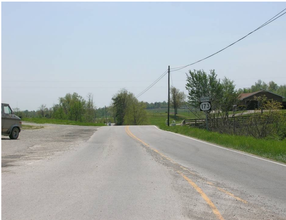
KY 173 & KY 32 (Rowan County)