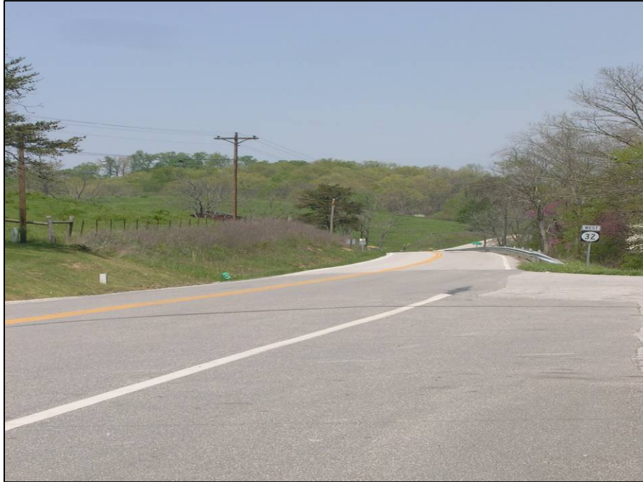
Looking north along KY 32 just north of KY 32 & Route 7 intersection (Elliott County)