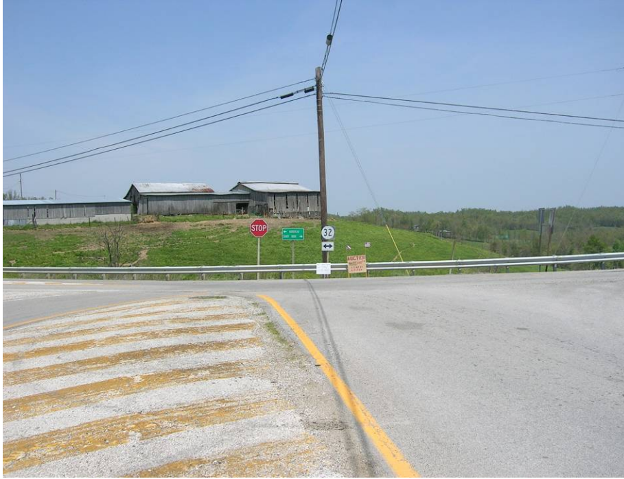
KY 173 & KY 32 (Rowan County)