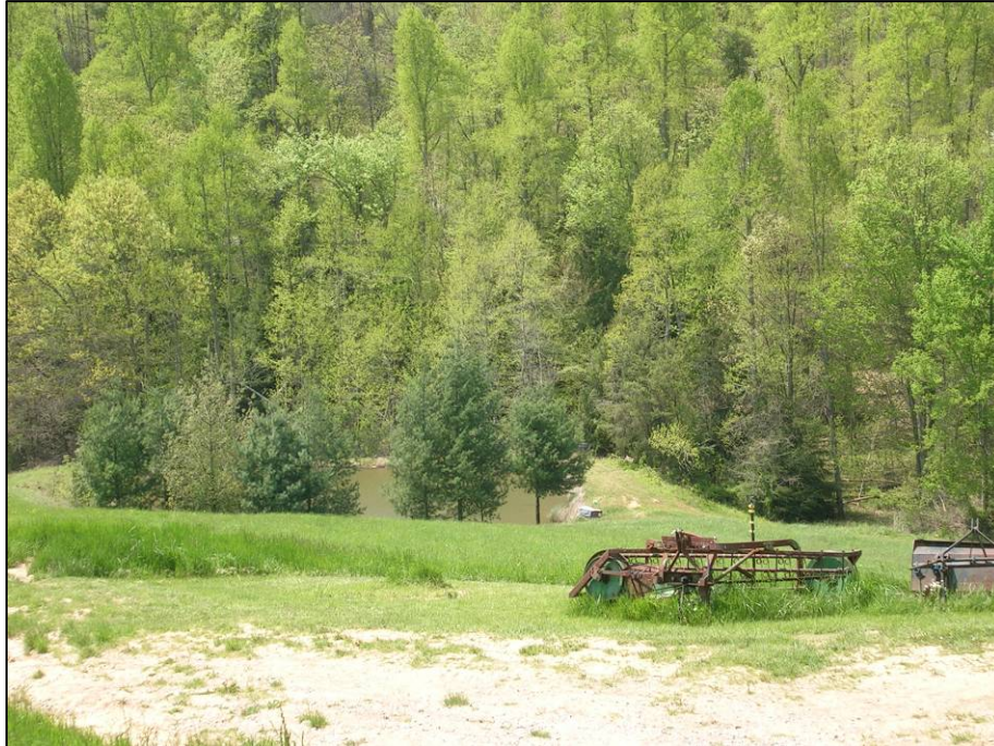
Water Pond (Elliott County)