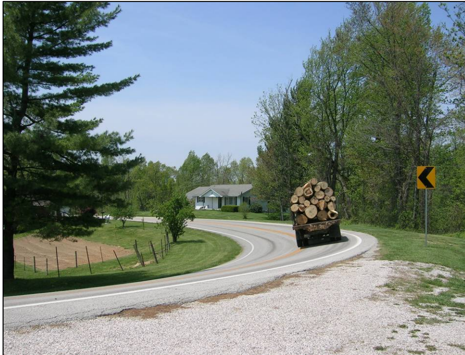
Northbound at Fraley Cemetery Road MP 19.066 (Rowan County)