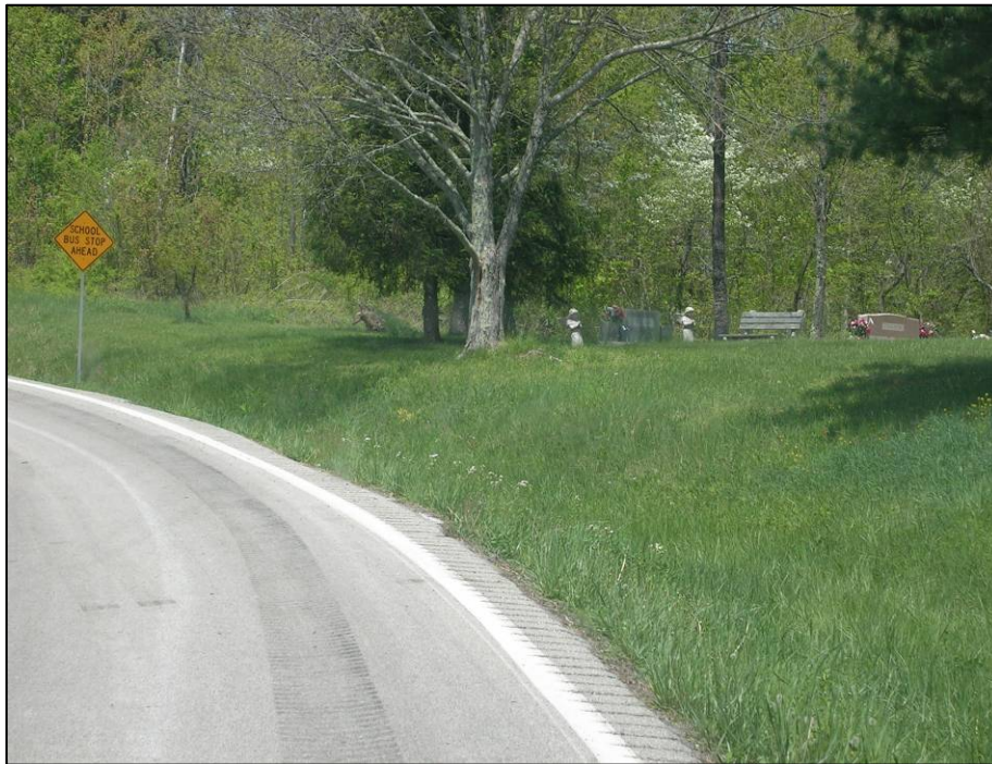
Cemetery by the road near MP 20.2 (Rowan County)