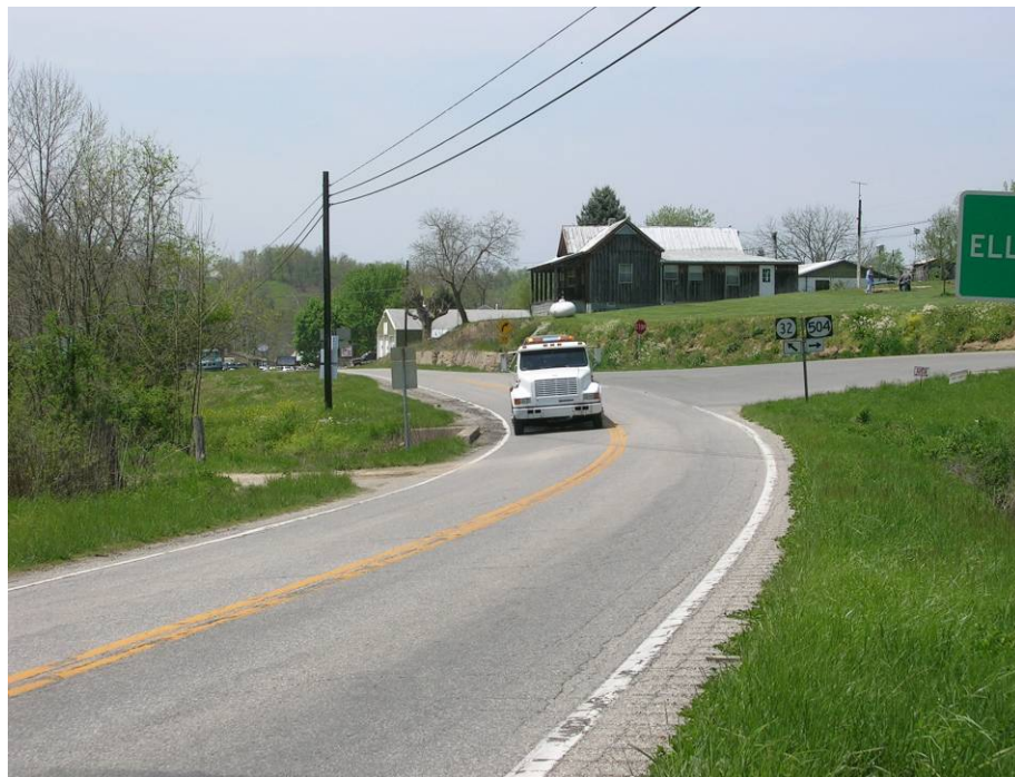
KY 32 & KY 504 (Rowan County)