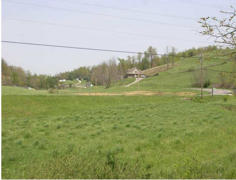
Looking along KY 504 from KY 32 (Rowan County)