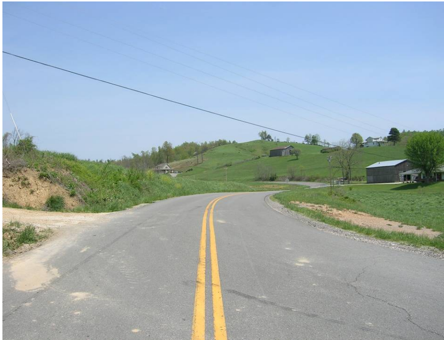
Looking along KY 504 from KY 32 & KY 504 intersection (Rowan County)