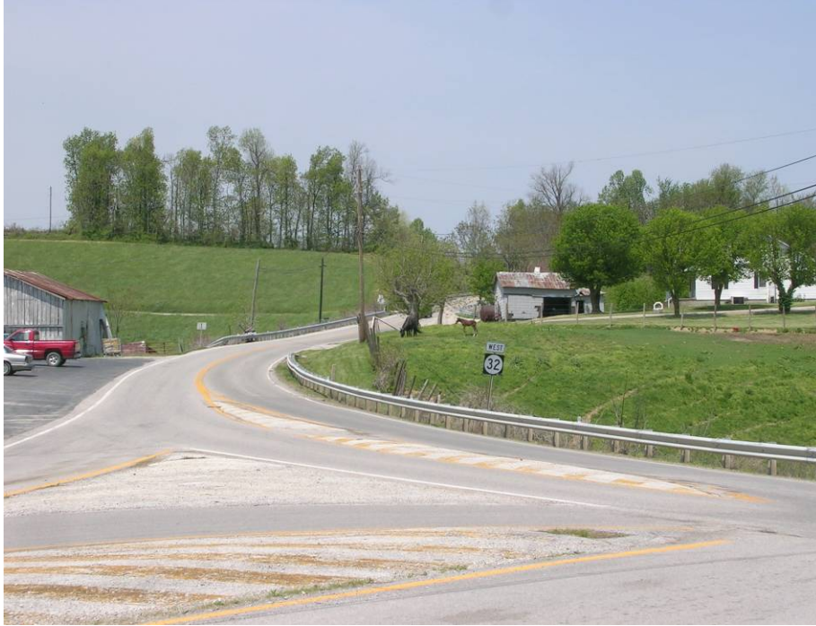
KY 173 & KY 32 (Rowan County)