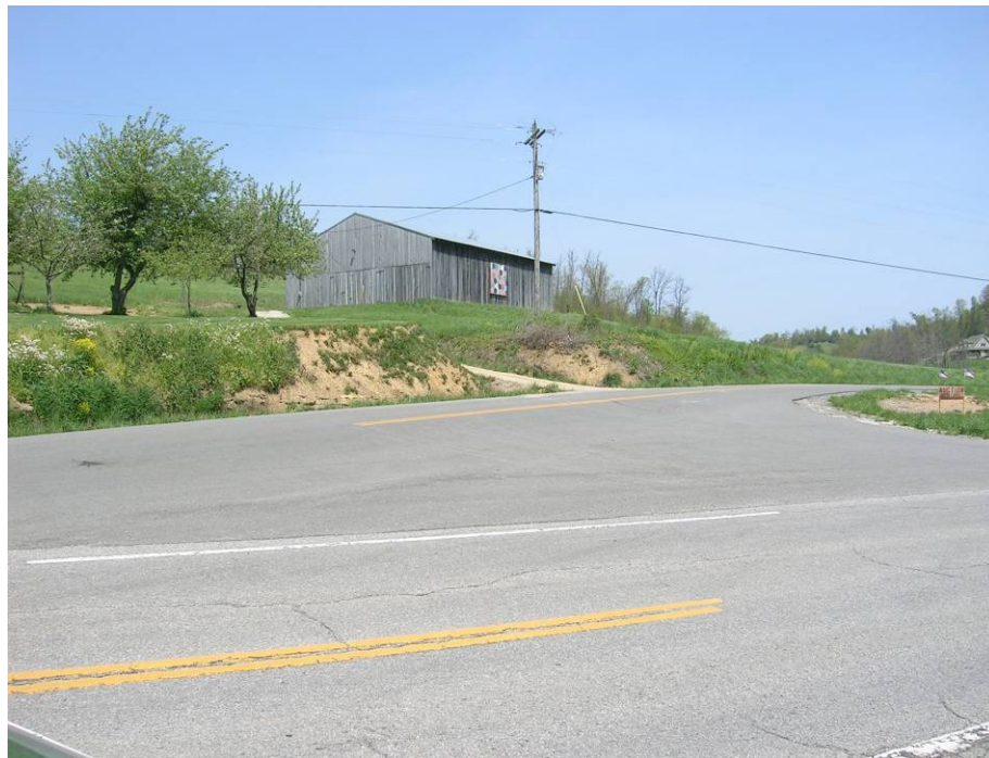
KY 32 & KY 504 intersection (Rowan County)