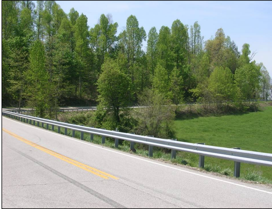
Rowan – Elliott County Line looking north into Rowan County