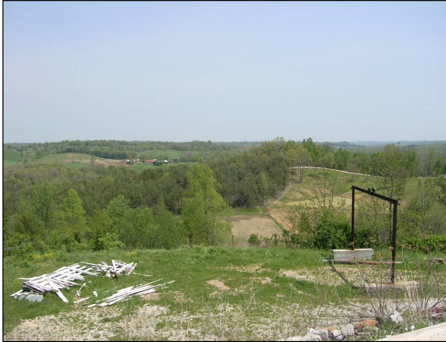
Near MP 6.8 (Elliott County)