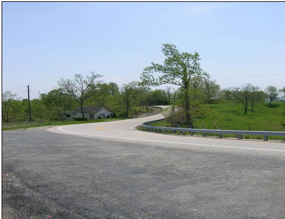
Near MP 6.8 (Elliott County)