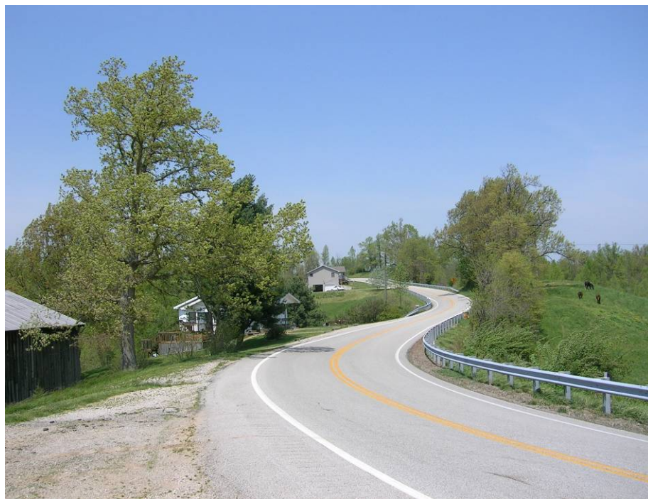
Northbound (Elliott County)