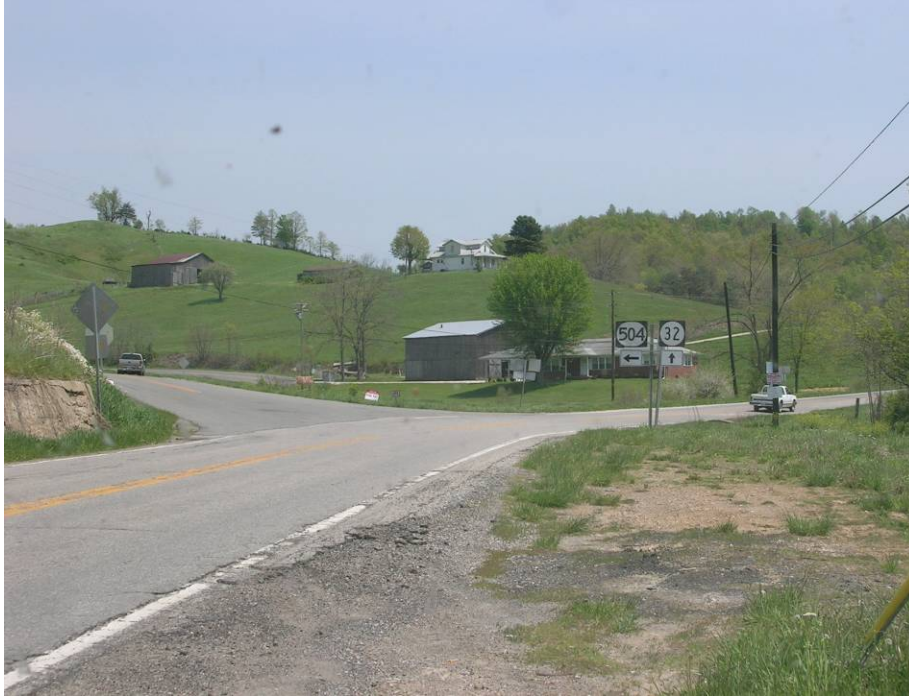
Looking South along KY 32 at KY 32 & KY 504 intersection (Rowan County)