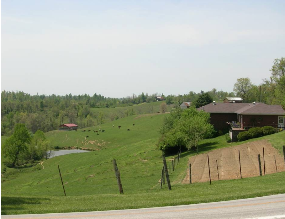
MP 19.066 (Rowan County)