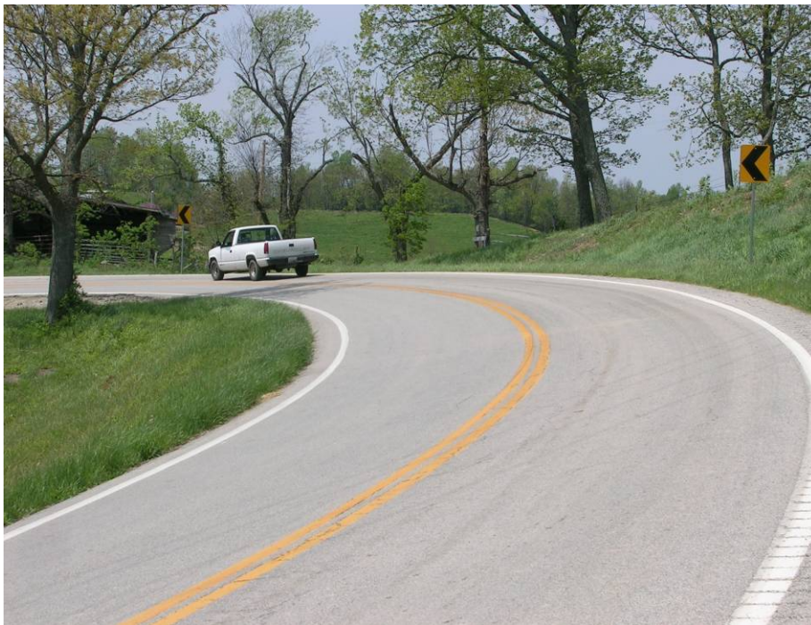
MP 17.9 (Rowan County)