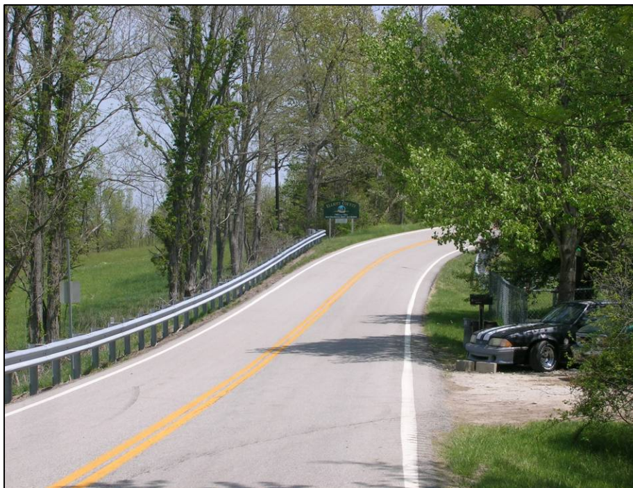
Rowan – Elliott County Line (Elliott County)