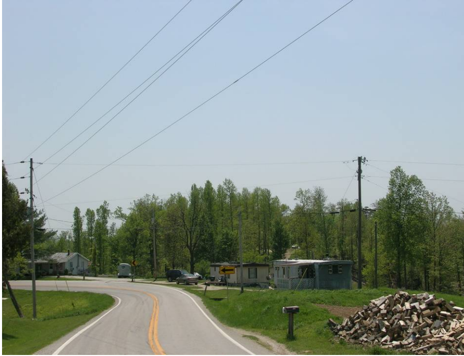
MP 17.9 (Rowan County)