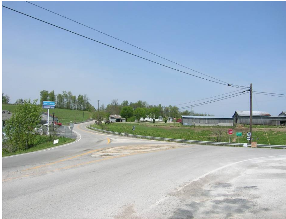
KY 173 & KY 32 (Rowan County)