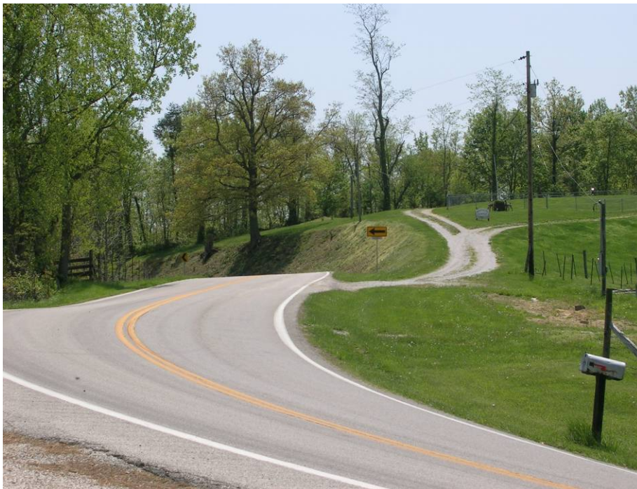
MP 19.066 (Rowan County)