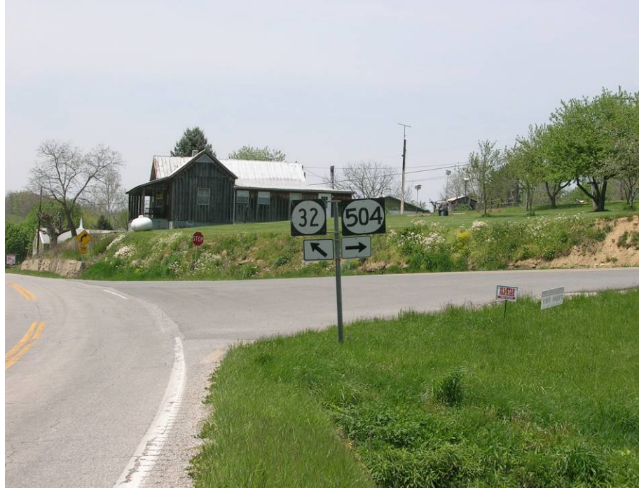
KY 32 & KY 504 (Rowan County)