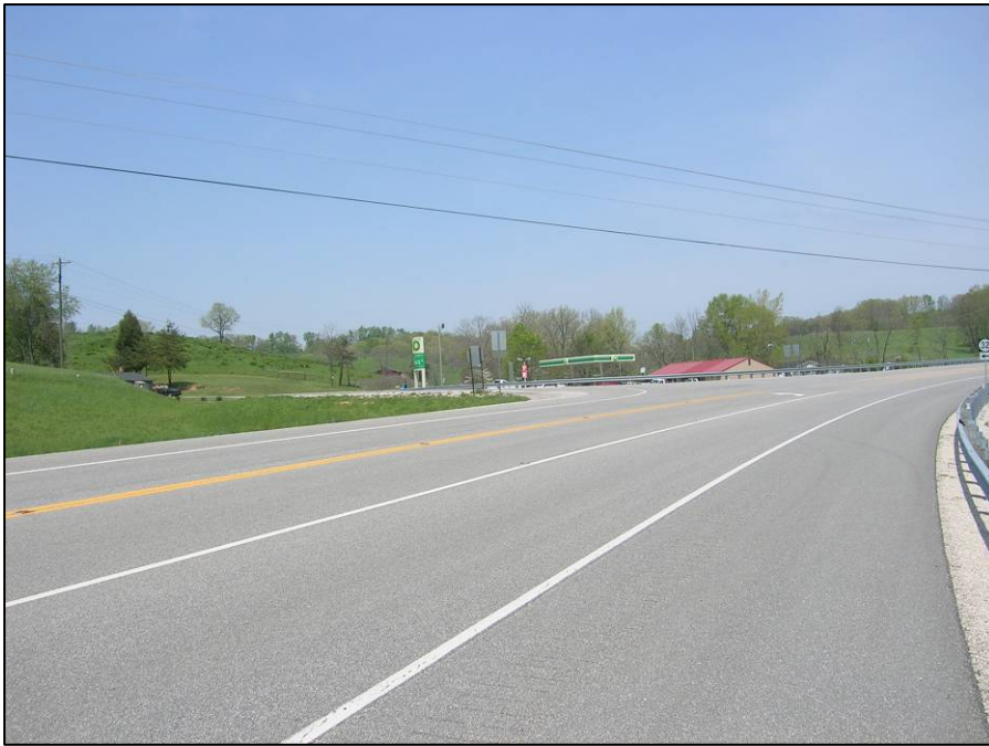
KY 32 and Route 7 (Elliott County)